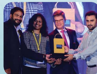
★ FORUM MALL CHENNAI