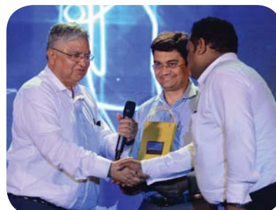
★ PHOENIX MARKET CITY BENGALURU