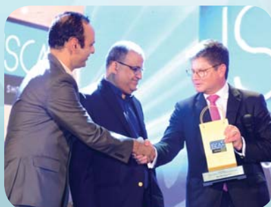
★ ORION MALL BENGALURU