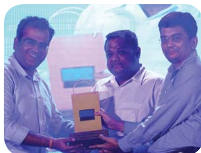
★ HIGH STREET PHOENIX MUMBAI