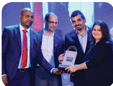
★ THE OBEROI MALL MUMBAI