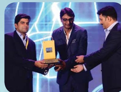
★ ELANTE MALL CHANDIGARH