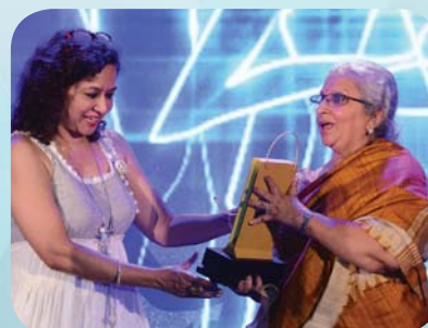
★ DLF MALL OF INDIA NOIDA