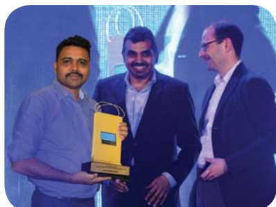
★ SOUTH CITY MALL KOLKATA