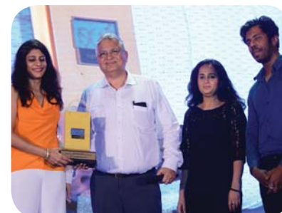
★ DLF PROMENADE NEW DELHI