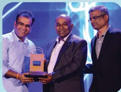
★ INFINITI MALL MALAD