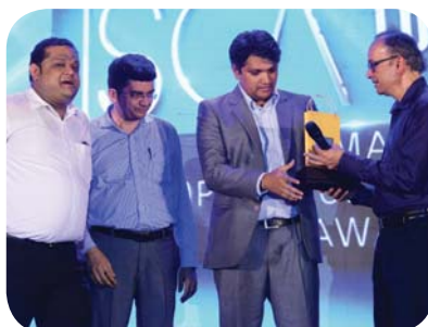
★ HIGH STREET PHOENIX MUMBAI