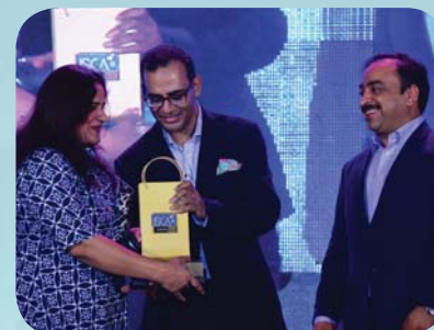
★ SELECT CITYWALK NEW DELHI