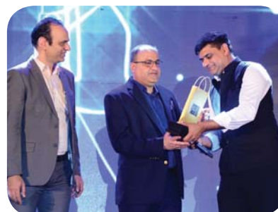
★ ORION MALL BENGALURU