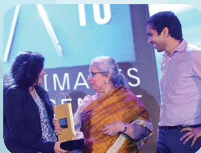
★ VR BENGALURU BENGALURU