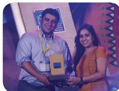
★ EXPRESS AVENUE CHENNAI