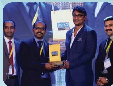
★ LULU INTERNATIONAL MALL KOCHII