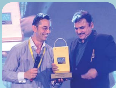
★ P&M MALL PATNA