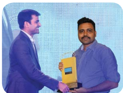
★ SOUTH CITY MALL KOLKATA