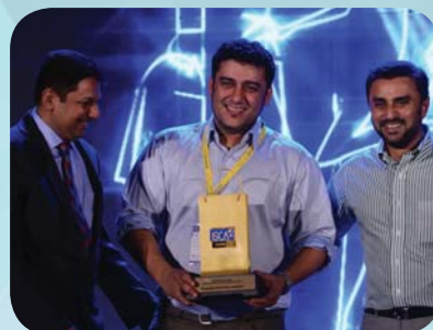
★ FORUM MALL KORAMANGALA