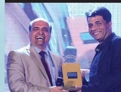
★ SAHARAGANJ MALL LUCKNOW