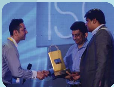
★ PHOENIX MARKET CITY PUNE