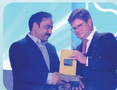
★ SELECT CITYWALK NEW DELHI