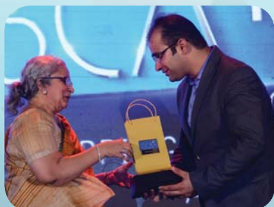
★ ACROPOLIS MALL KOLKATA