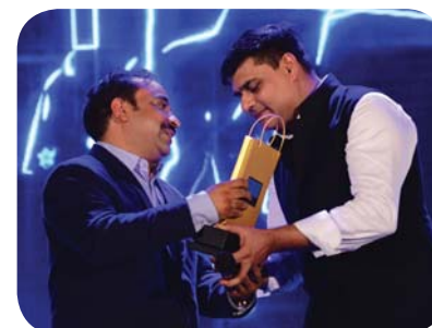
★ SELECT CITYWALK NEW DELHI