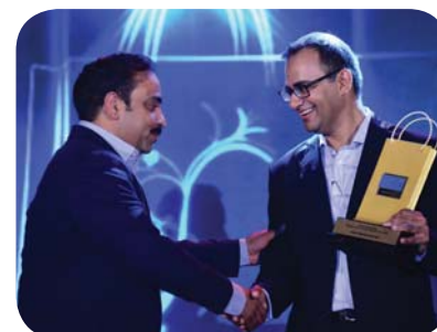
★ SELECT CITYWALK NEW DELHI