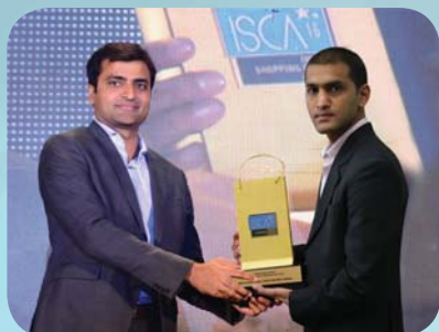
★ SOUTH CITY MALL KOLKATA