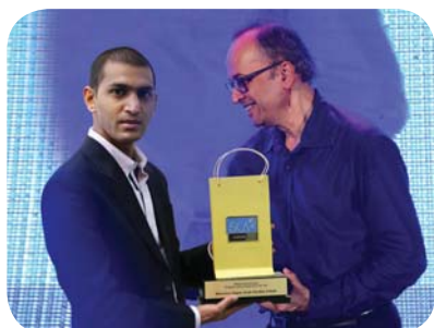
★ SOUTH CITY MALL KOLKATA