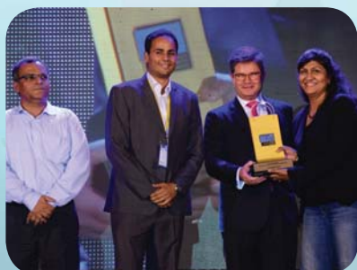
★ VIVIANA MALL THANE